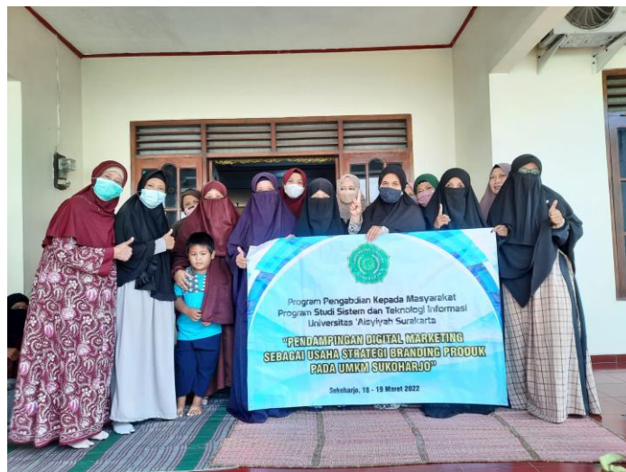
Picture.1 Assistance Digital Marketing