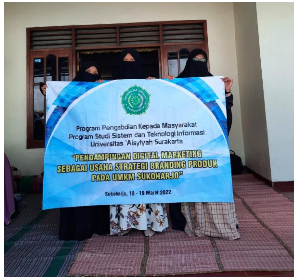
Picture. 2 Team devotion

Sidomulyo RT 07 RW 21, Cemani, Grogol, Sukoharjo, Central Java. Because it is still in the pandemic covid-19, so we still do offline activities in accordance with the protocol on health, wash your hands, wearing a mask, not coughing and sneezing and watching indoor air circulation during activity. In addition, we share training module, a mask, stiker and handsanitizer to each participant training and digital marketing and we assist to an offender MSMEs in Sukoharjo.