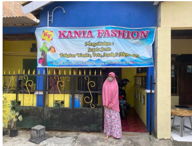
Picture. 4 One of the participants

In addition to conducting a two-day training, the trainer also made a direct visit to provide private assistance to several participants of the Digital Marketing Assistance training as a Product Branding Strategy Business at MSMEs in Sukoharjo. The outer covering of devotion already performed is devotion to the journal for coach and booklets guide branding, wearing canv products adobe photoshop and corel for all.