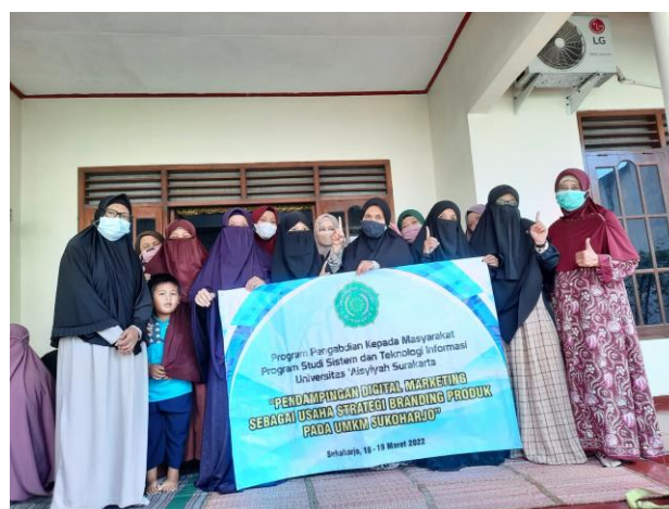
Picture. 3 All Participants

All participants have seen simulating how canva branding products used the aid application, adobe photoshop and corel draw and how to benefit from social media like facebook and instagram as media. Participants said impressed and unable to make branding their products own and able to expand of this training.